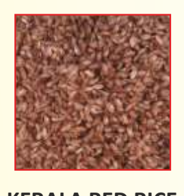
KERALA RED RICE