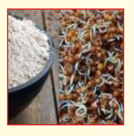
SPROUTED RAGI POWDER