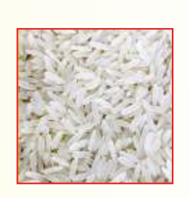
SONA MASOORI RICE