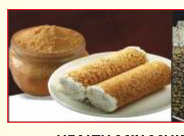
HEALTH MIX MULTI CEREALS